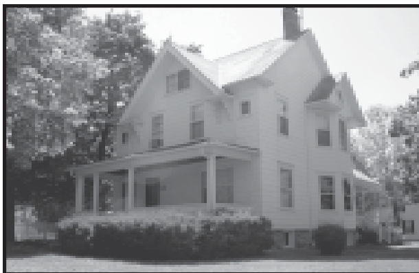
Rosenthal House - today 41 W. Crystal Lake Avenue

The name "Rosenthal" has been connected with the flour, feed, coal and lumber business in this city since 1906, when the firm of Rosenthal & Rehberg was formed. Initially, Rosenthal & Rehberg operated the principal feed mill in the area. The mill was located on one acre of property and included various warehouses and sheds.